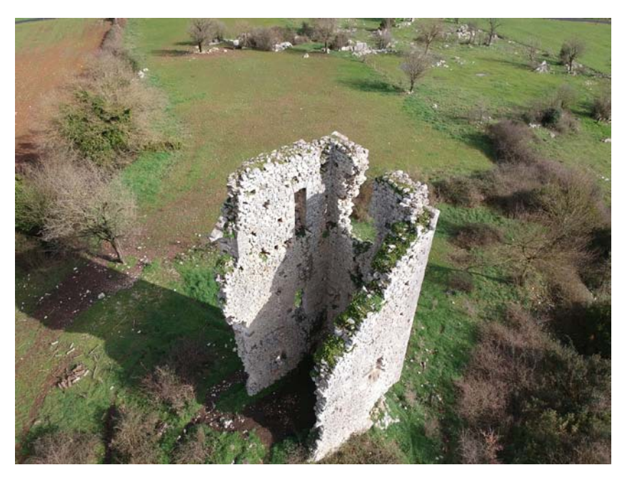
Figure 3. The medieval tower of Pisterzo, a material sediment and symbol of the cultural heritage of the Amaseno Valley, which needs an urgent project of restoration, protection, enhancement and use of ecotourism.

The complex of "sediments" stratified in the territory over the centuries refers to the past territorialization phases and delineates the identity characters<sup>4</sup>. Magnaghi divides the sediments into two categories: "cognitive sediments" and "material sediments" (Fig. 3).