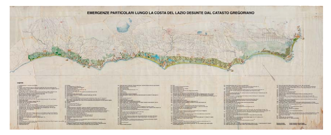
Figure 1. Emergenze particolari lungo la costa del Lazio desunte dal Catasto Gregoriano , Colandrea O., Ruggieri A., XX century, Archivio di Stato di Roma. This historical map highlights the cultural heritage of Lazio and shows the toponyms of the archaeological emergencies taken from the "Catasto Gregoriano" (XIX century)

The relational component and the participation of local communities are indispensable so that the territories are not confused with "simulacra, theatrical or museum representations of the past identity" but are perceived "as potential producers of new identity" (Magnaghi, 2010). It is not a question of imposed and artificial museification, but of a more structured process of capitalization, conceived in the perspective of continuous and inexhaustible production of assets for the achievement of territorial added value.