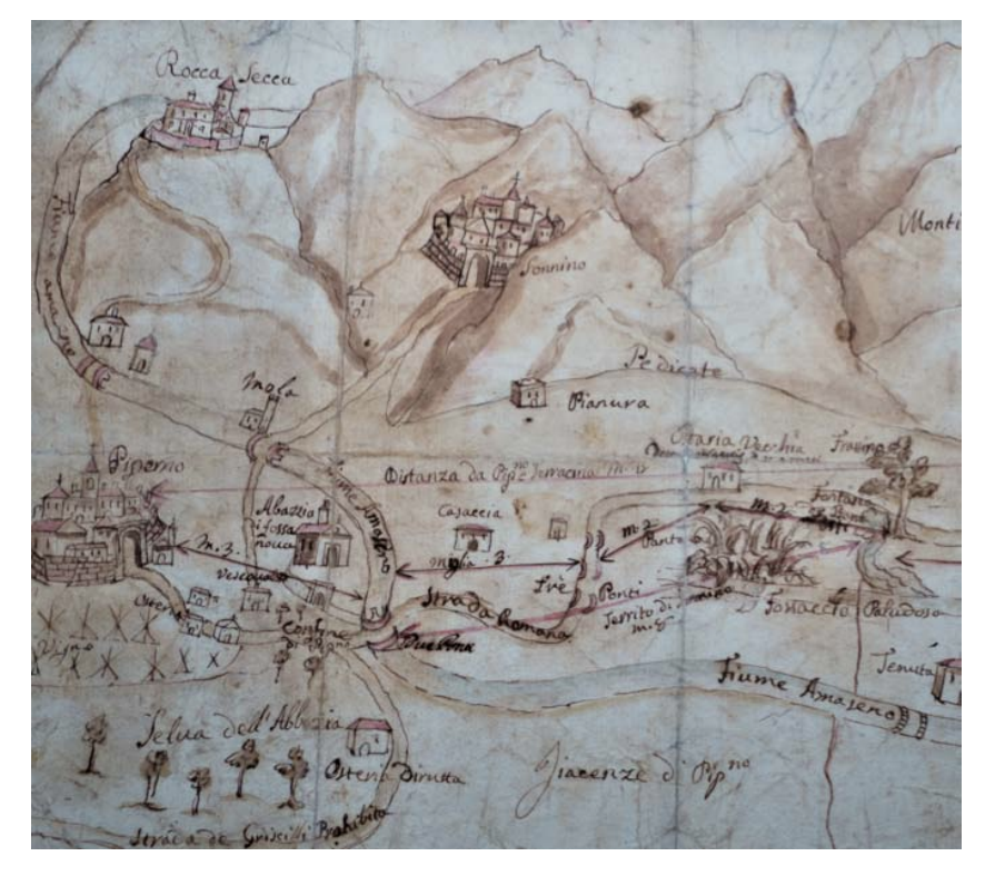
Figure 4. Pianta del territorio di Sonnino e confine con Terracina, autore anonimo, XVIII secolo (ASR, Coll.1, Cart. 104, n.178bis). The Valley of Amaseno river.

Since ancient times the geographic position of the Valley has been a source of attention and particular interest for human settlement. It is a territorial reality characterized by a great geomorphological and landscape variety that ranges from the Agro (in which you can notice the characteristic features of the sharecropping system), to the mountain (consisting of extensive wooded areas dominated by the socio-economic organization based on agriculture and breeding), from the marsh to the fertile fields, surrounded by springs, from the valley bottom areas, crossed by the river Amaseno, to the urban centers in the hills of the Lepini and Ausoni mountains.