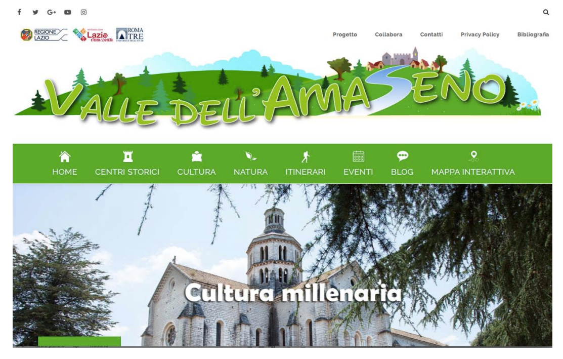
Figure 6. Home page of Amaseno Valley cultural web portal

The work carried out made it possible to develop a methodology for tourism promotion of marginal and peripheral areas rich in geographical heritage and to lay the foundations for a lasting and sustainable economic and social development in the future. It is, in fact, an institutional prototype to be proposed to the other territories of the Lazio Region and to other Italian and European regions, in order to establish a network of platforms inspired and managed according to the principles of electronic democracy and digital platform cooperation.